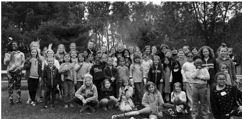
Girls Choral Academy