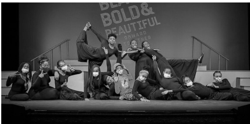
Xpressions of Praise Dancers